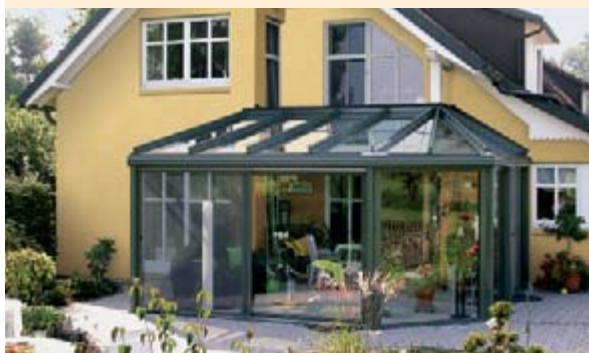
▲ weinor conservatories

No matter what you want to use your patio for, weinor has the right product for you – awning, patio roof, Glasoase® and conservatory