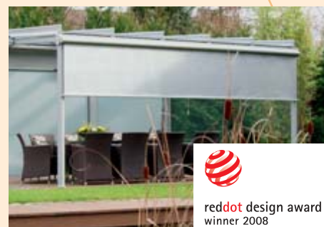
▲ weinor patio roofs with VertiTEx awning